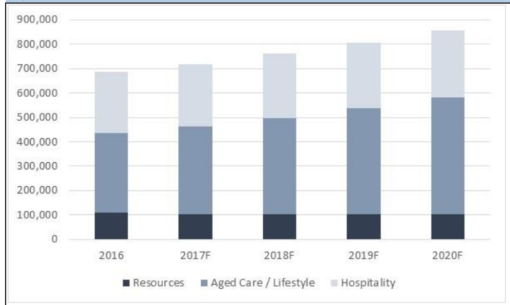
Fig. 6: Addressable Market Opportunity (units)